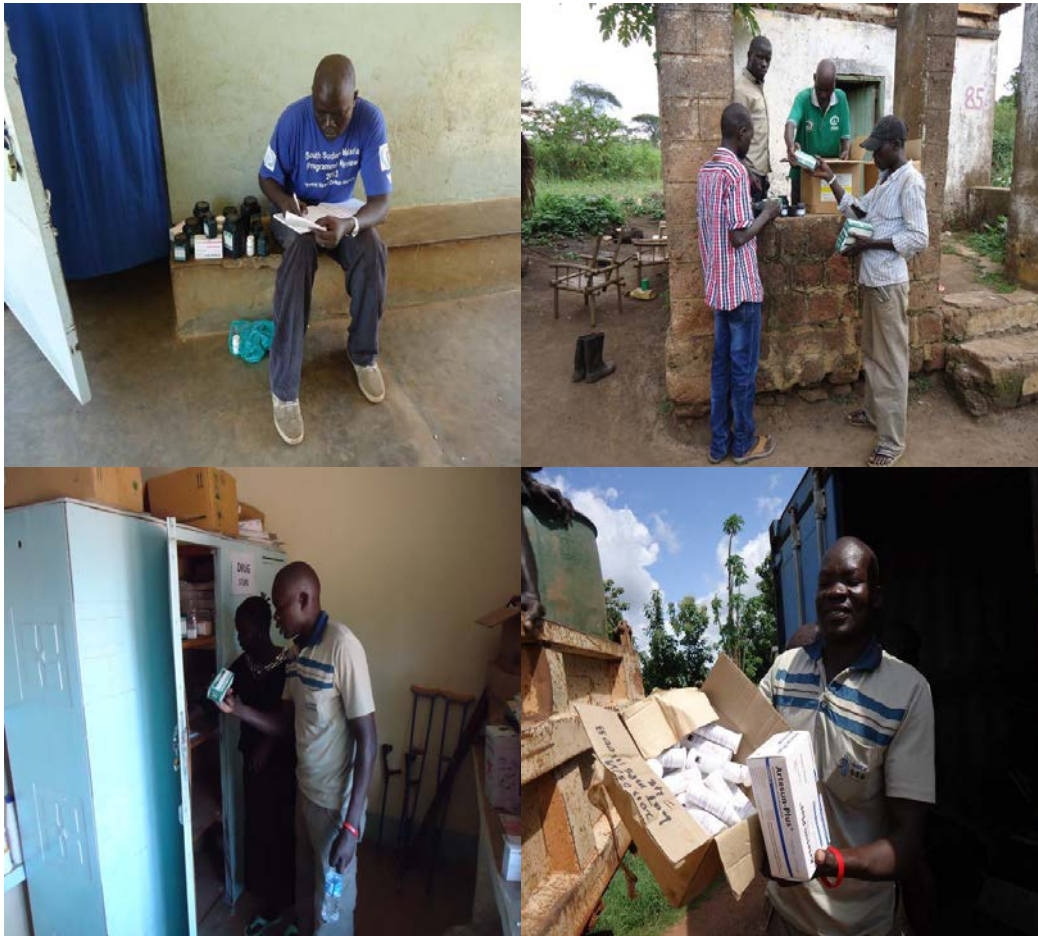
SIAPS team during de-junking in Yei 2014