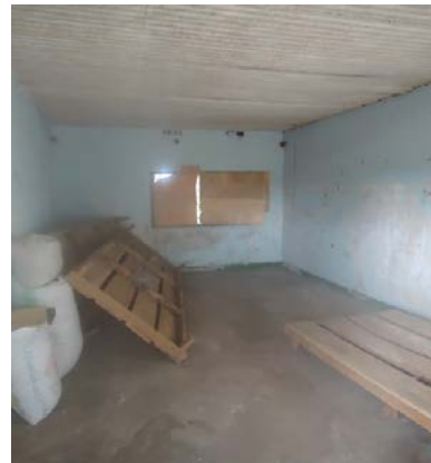
Terekaka County medical store before and after de-junking