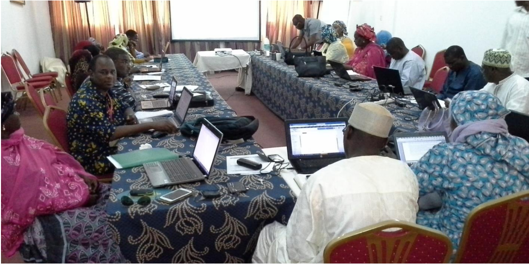
Malaria Quantification workshop participants October 7-9, 2015, at Africa Hall, Niamey