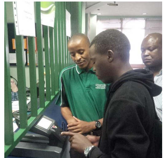
The biometric scanner recognizes a patient's fingerprint at one of Tshwane Metro's clinics.

RxSolution enables patient information to be retrieved and prescription history to be displayed on the screen once the patient has been identified within the system.