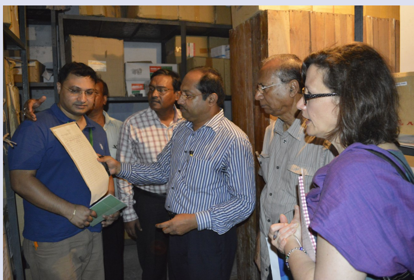
SIAPS and MaMoni team visit the Lakshmipur district health department to assess the store management system.

and supplies in the district. The situation analysis employed a combination of qualitative and quantitative data collection methods. To share the findings of the analysis, a dissemination workshop will be organized by SIAPS and MaMoni HSS where the participants will include key GOB officials, stakeholders, partners, and donors.