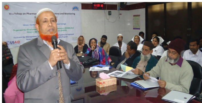
A participant at the PV workshop at Rajshahi shares his opinion.

To engage more health practitioners outside of Dhaka in the PV program, two half-day workshops were facilitated by SIAPS in the Chittagong Medical College Hospital and Rajshahi Medical College Hospital on December 1 and 14, 2014, respectively. More than 160 physicians and nurses from the hospitals, along with many private