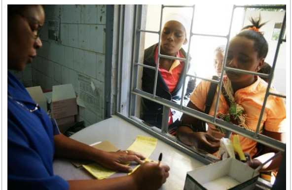
A pharmacist in Chokwe, Mozambique dispenses Coartem, and explains to a mother how to administer the prescription to her child with malaria.

To address this dire situation, SIAPS uses systems-strengthening approaches and tools to improve access to health products and services. Our technical experts work with local and national country representatives to develop and support adoption of sound pharmaceutical policies, effective management, strengthened regulatory systems, equitable financing, and assured product quality and safety practices in developing countries across Africa, Asia, Eastern Europe, Latin America and the Caribbean, and the Middle East.