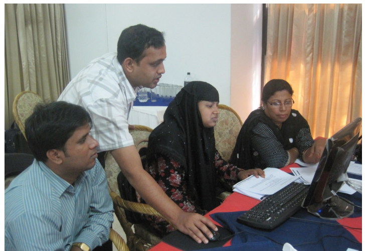
A SIAPS program associate provides hands-on training to the participants.

A total of 84 DGFP staff from 28 upazilas (3 persons from each) participated in the basic training. With the 28 new upazilas, the number of UIMS installed is now 173.