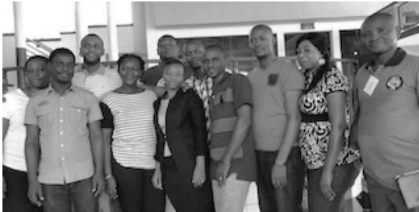
DDMS staff in LDP training conducted by SIAPS in May 2017